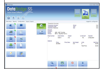
Easy to Use Interface Touch Screen Capable